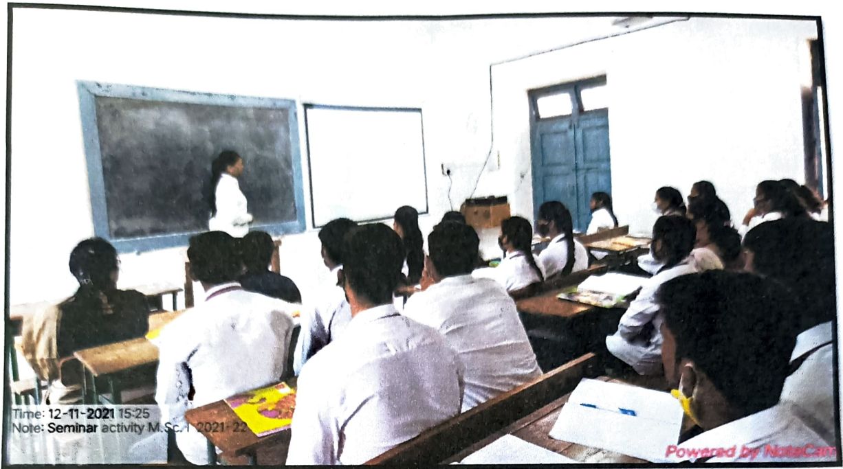
Time: 12-11-2021 15:25 Note: Seminar activity M.Sc. I 2021-22