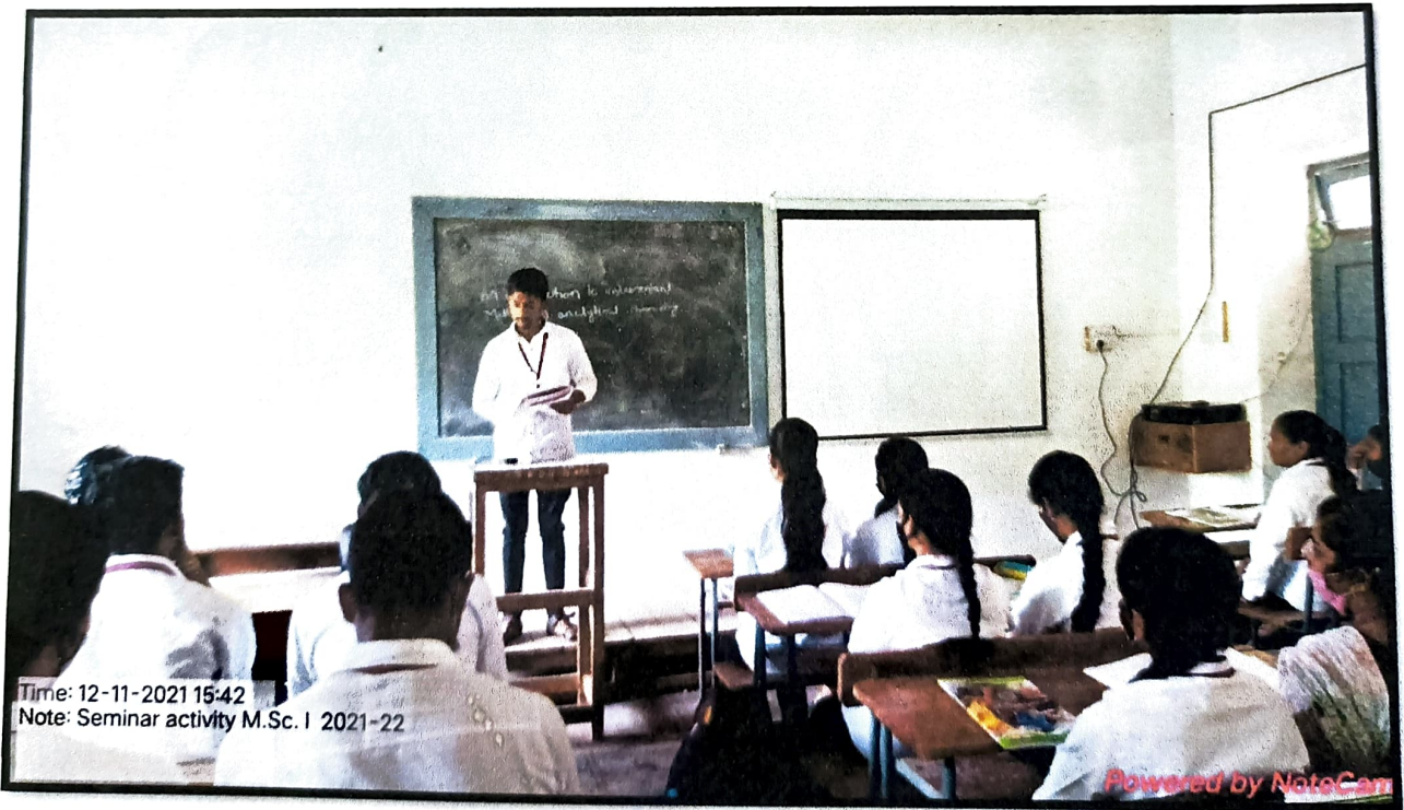
Time: 12-11-2021 15:42 Note: Seminar activity M.Sc. I 2021-22